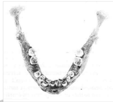
Anglo Saxon jaws from the 6th century AD, showing crowding and irregularity of the teeth.