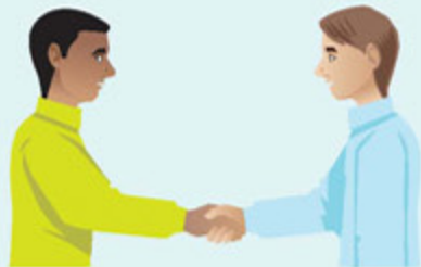
shake hands with someone