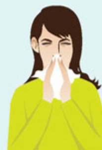
blow your nose