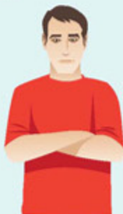
fold your arms