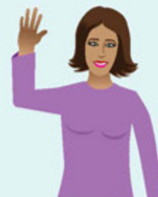
wave to somebody