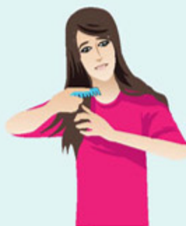
comb your hair