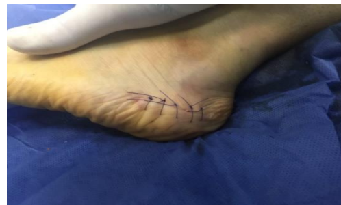
Figure 5: Wound suturing

2 males (22.2%) were labors and 5 males (55.4%) with miscellaneous jobs. Regarding the body mass index 5 patients (29.4%) were obese ( BM \geq 30 ), 8 (47.11%) were overweight ( BM = 25-29.9 ) and 4 patients (23.5%) were ideal ( BMI = 20-24.9 ).