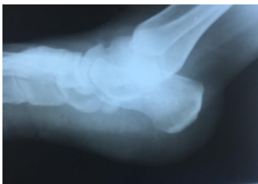
Figure 2 : Pre-operative X ray

Lateral x-ray of both heels in standing position was taken (Fig.2), six patients showed no calcaneal spur, 10 showed unilateral spur on the painful side for which operation was done .None of them showed abnormal pathologies on the plain x-ray or abnormal biomechanical alignment of the foot bones. The heel pad thickness was between (7-11mm) mean of 9mm (normal range is 9.9mm for 20-40 year and 11.5for 41-60 year). X-ray of the knee and lumbar spine were taken to exclude osteoarthritis