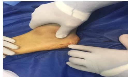
Figure 3 skin incision

aplastic giving set for intravenous fluid with one unit (500cc) of isotonic normal saline. Then after intraosseous pressure measurement, open the periosteum by sharp dissection and elevate it by periosteal elevator to expose the bone, with the use of electrical drill or preferably a hand drill using 2 mm drill bit perform 5 holes through the calcaneum from lateral cortex to the medial cortex in a horizontal manner 1 cm above the inferior edge of the bone and the holes separated (Fig.4). Only skin was closed without drain (Fig.5), the foot wrapped with compressive bandage, elevation for 72 hours, complete weight bearing allowed 3 days postoperatively