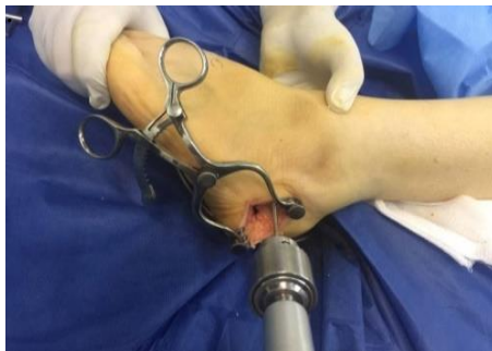
Figure 4: Drilling

the purpose of measuring the intra osseous pressure, a longitudinal 5cm lateral skin incision was done 1 inch below the tip of the lateral malleolus extending anteriorly from the peroneal trochlea to the lower insertion of the tendo achillis to the calcaneum posteriorly (Fig.3), only the skin was opened by sharp dissection, isolate and ligate the communicating veins, carefully isolate the sural nerve and the small saphenous vein and protect them, now the flat lateral surface of the calcaneum exposed with the peroneal tendons enclosed in the inferior peroneal retinaculum in the upper part of the wound and the fleshy belly of the abductor digiti minimi in its lower part. Leaving the periosteum intact until the intraosseous pressure measurement in the calcaneum is completed by using a simple device (central venous pressure measurement set ) consisting of a plastic tube with an end filter and clamp a white scale graded from 2 to 29 cm with a red bar slides over the scale up and down and gutter which can adapt tube a wide bore thin wall siliconed needle of 2 cm length and (180G) a three way valve adapter and