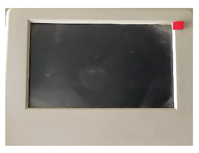
Fig. 3: Spectrophotometry

The difference between time intervals for salivary enzyme LDH level using least significant difference test (LSD) showed that there was a statistically significant difference (p < 0.05) between base line time and one-hour post-insertion of monoblock appliance, while there were