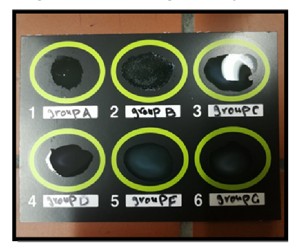
Fig. 2 : Lancefield's group show Streptococcus agalactiae positive (circle no.2)

A sensitivity test was performed to Streptococcus agalactiae isolated from cow's milk with mastitis towards 10 antibiotics by using the diffusion method. Out of the 10 bacterial isolates Streptococcus agalactiae , (100%) showed resistance to Cloxacillin, Erythromycin Furthermore, (80 %) of the isolates were resistant to and Ceftriaxone, Cefixime, (60%) to Trimethoprim/Sulphamethoxazole. On other hand, most isolates (90%) were susceptible to Chloramphenicol followed by (80%) of bacteria sensitive to Penicillin and Ampicillin, (70%) to Gentamicin and also (60%) to Streptomycin.