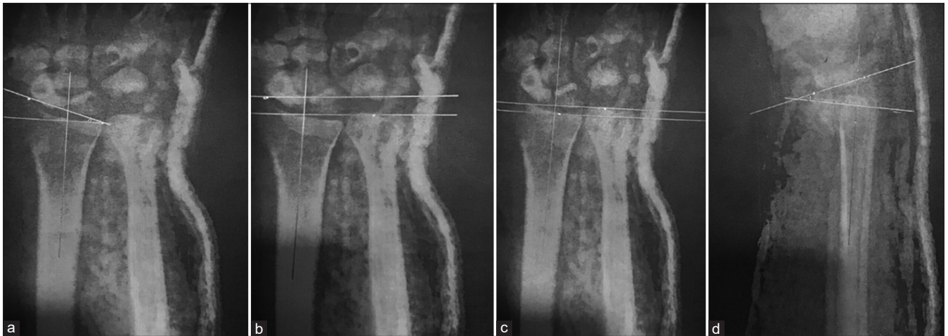
Figure 2: Pre-operative measurement. (a) Radial inclination 20°, (b) radial height 8°, (c) ulnar variance 4 mm, and (d) volar tilt 18°