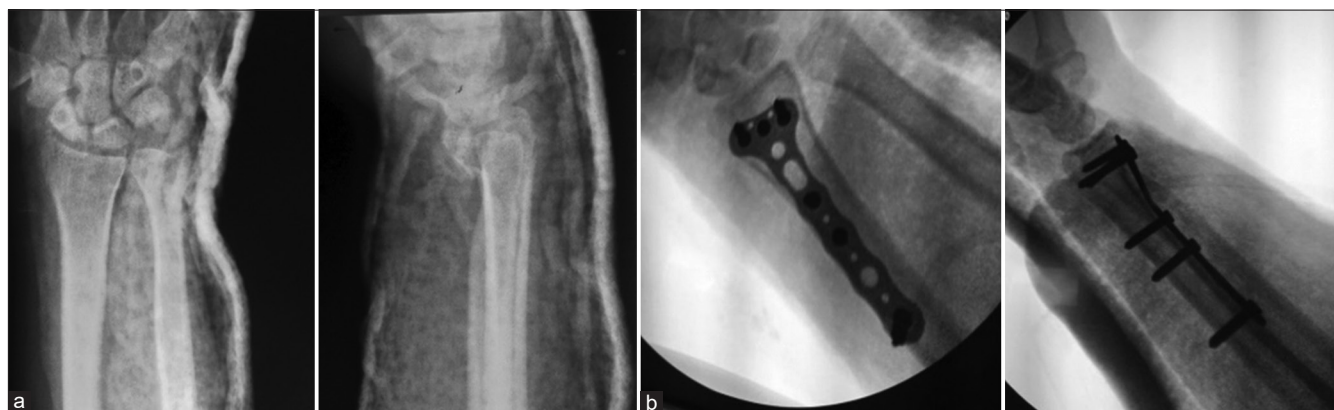
Figure 1: X-rays of the right wrist, PA view and lateral view. (a) Pre-operative and (b) post-operative

Once the first screw is inserted, distal traction on the fingers can be released because the fracture usually is appropriately reduced and fixed. Because of the fixed angle design, the screws may perforate into the radiocarpal joint if the plate is placed too far distally. Obtain fluoroscopic views tangential to the subchondral bone in both the coronal and sagittal planes to assess for intra-articular penetration. After placement of the distal screws, place the remaining proximal screws. Reattach the pronator quadratus with braided absorbable sutures. Median nerve not released in the surgery. Release of tourniquet, cauterization, insert Redivac drain, suturing in layers, dressing, and below-elbow backslab.